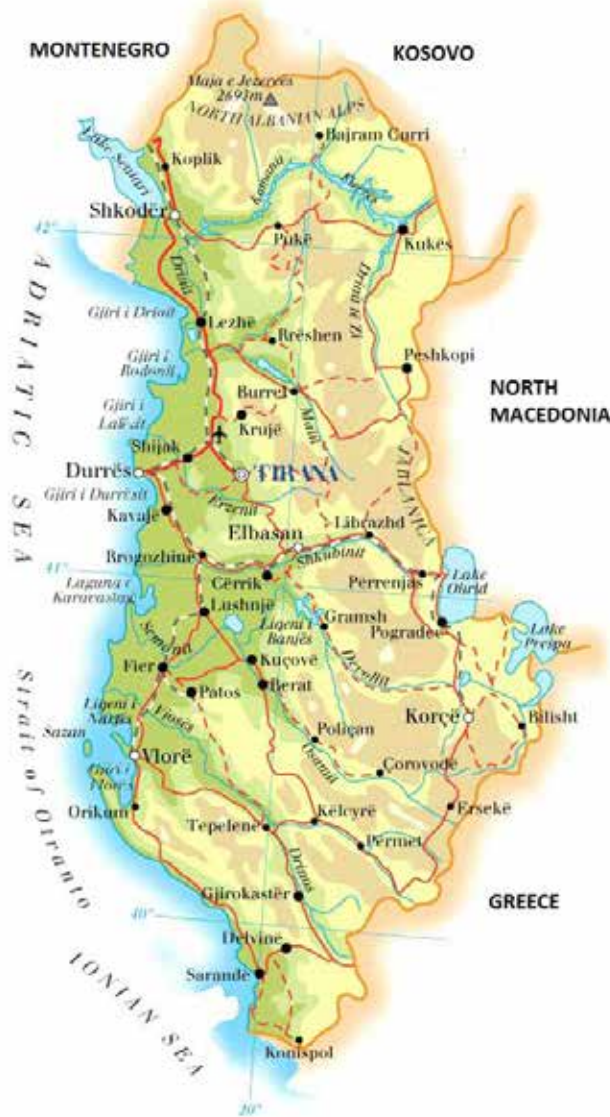
Map 1. Map of Albania

Albania is located in south - western part of Balkans peninsula, Southeast Europe. The country is linked with the rest of the world via land, sea and air routes.